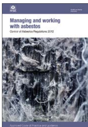
L143 (Second edition) Published 2013

This publication contains the Control of Asbestos Regulations 2012, the Approved Code of Practice (ACOP) and guidance text. Two ACOPs, L127 ( The management of asbestos in non-domestic premises ) and L143 ( Work with materials containing asbestos ) have been consolidated into this single revised ACOP. The presentation and language has been updated wherever possible. It provides guidance text for employers about work which disturbs, or is likely to disturb, asbestos, asbestos sampling and laboratory analysis. It also provides guidance on the specific duty to manage asbestos on the owners and/or those responsible for maintenance in non-domestic premises.